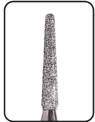
Cone Bit (Narrow)