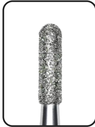
Round Cylinder Bit